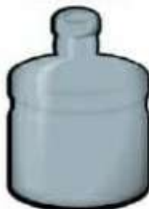
Large water bottle